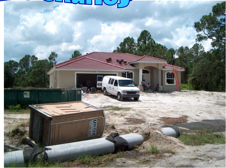
Morey's E-WALL home North Port, Florida