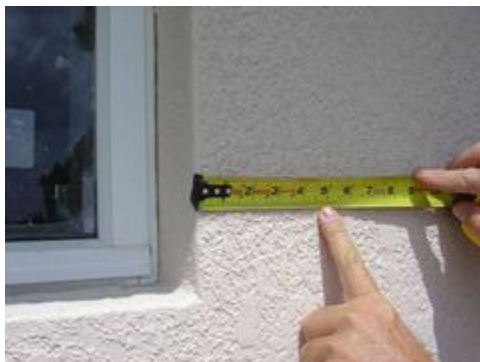
3 3/4" to Grommet Center

For example, if the actual "buck" width of the opening on a concrete structure is 37", the grommet to grommet measurement for ordering should be no less than 44 1/2" wide. If the actual "buck" height is 63", the grommet to grommet measurement should be no less than 70 1/2" high. If there is a sill involved, extra height may be needed to accommodate.