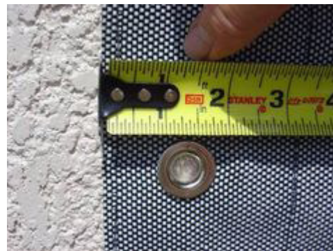
1 1/4" From Center to Edge

Concrete Structures: Place Grommets at least 3 3/4 inches from edge of 'Buck' opening