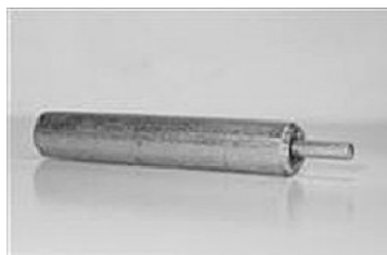
Setting tool for anchors

If you are using the flush mount anchors, they are best installed with a tool designed for that purpose. This tool ( see picture below ) makes it easier to get the anchor to be flush with the mounting surface. Greenlee Products is one manufacturer. You can find it at most big box DIY centers.