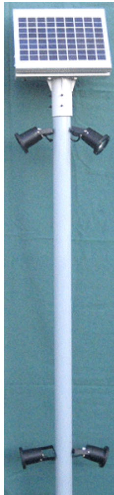
SCL5 Solar LED Dock Light