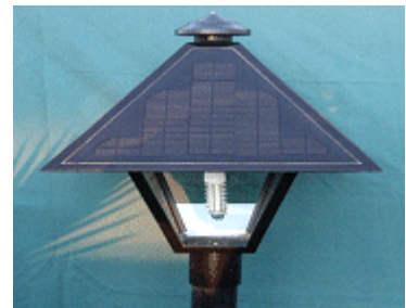
SCL2 Solar LED Coach Light Snow Top