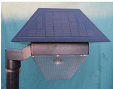
SCL3 Solar LED Down Light