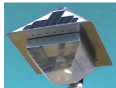
SCL4 Solar LED Parking Lot Light